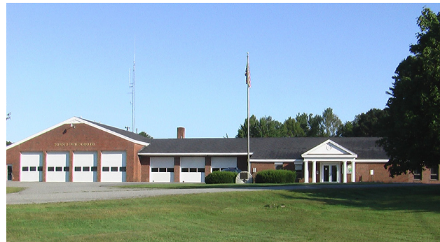
Waldoboro's municipal building houses all Town offices, as well as the Fire Department and Ambulance Services.

Waldoboro strives to ensure the public safety and care for its residents. Along with Town offices that will assist with any concerns during office hours, the municipal building also has 24-hour emergency services ready at a moment's notice.