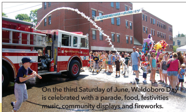
On the third Saturday of June, Waldoboro Day is celebrated with a parade, food, festivities, music, community displays and fireworks.

From artisans, clambers, restaurants, and manufacturers, Waldoboro is a town that wants to grow with your business.